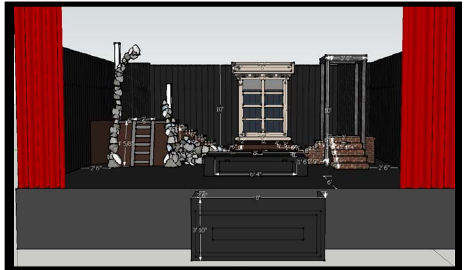
Drawing for the set of The 39 Steps .

A life-sized dummy is needed. Didn't we have one for Sweeny Todd? We also need a scythe (sometimes called a sickle)—long handled or short. Contact Paul Dorset by email, if you have a lead on either item.